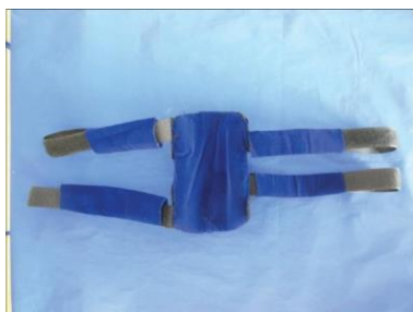
Fig 9 - Modified RURS elbow guard

II (b)-Modified RURS elbow guard with the conventional design but modified length of the appliance extended at both the ends by 2.5 inches worked the same for anti thumbsucking. 31 (Fig. 9)