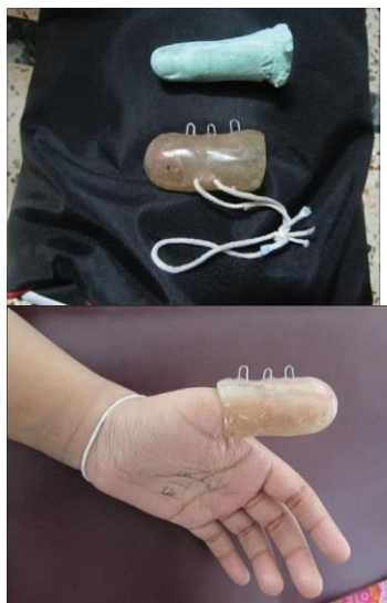
Fig 7 - Thumb guard with cribs made on duplicate alginate thumb