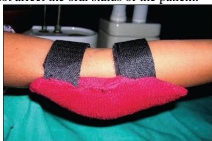
Fig 8- RURS elbow guard tied with Velcro strap

II (a)-RURS elbow guard- RURS elbow guard is an extraoral appliance for antithumb sucking. (Fig 8). An acrylic elbow guard was made with cast impression of elbow at 45-60 degree. It was tied with Velcro straps. It does not affect the oral status of the patient. 30