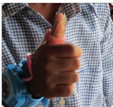
Fig 14- Child wearing the alarming wrist watch

Other methods include use of hand puppet, long sleeve night gowns. 4