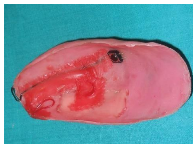
Fig 11- The switch button was placed in the inner side of the acrylic elbow guard