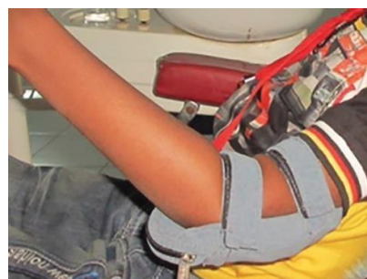
Fig 12- Patient wearing the modified three alarm system