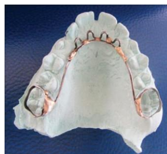
Fig 6- Palatal crib intraoral component of Sudipta Kar's cribbed thumb guard

I(g)- Sudipta Kar's cribbed thumb guard- Habit breaking appliance with palatal crib was fixed intraorally. (Fig 6) Thumb guard with 3 cribs and two holes are made in the opposite side of the cribs to incorporate one smooth elastic band into the appliance. It was made on duplicate thumb, after taking impression from alginate (Fig 7)