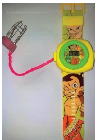
Fig 13- Alarming wrist watch