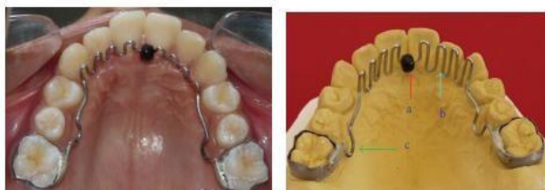
Fig 2 – Hybrid Habit Correcting Appliance

I(b)- Hybrid Habit Correcting Appliance (HHCA)- It is used in patients in constricted maxilla and posterior cross bite which is a result of both thumb sucking and tongue thrusting habit. The appliance consists of a tongue bead, a palatal crib and a U-loop attached to the molar bands on either sides. The bead works as a reminder, palatal crib works as a reminder and physical restrainer. U loop is useful for the retraction phase in fixed orthodontic therapy. 17 (Fig 2)