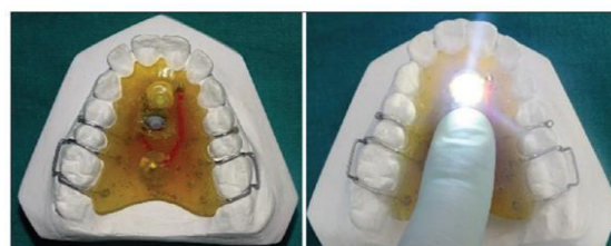
Fig 5- Light emitting diode habit breaking appliance

I(f)- Light emitting diode habit breaking appliance- The appliance consists of Hawley's fabrication with light-emitting diode bulb and switch attached to it. When the child's tongue or the finger touches the appliance, for the act to suck the thumb, the light bulb gets illuminated acting as a reminder. The associated theory behind this is psychological re-rooting of the patient's action. 28 (Fig 5)