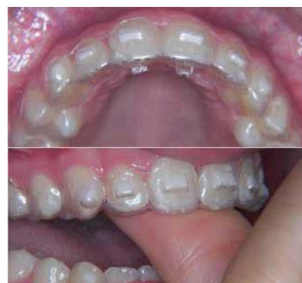
Fig 4 – Invisalign Teen – aligners placed on palatal surface

This prevented the placement of thumb in mouth 27 (Fig 4)