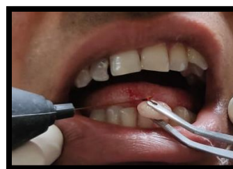
Fig. Excision by laser