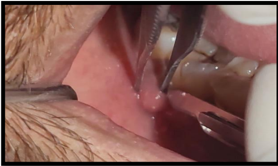
Figure 5 - Complete excision of the lesion using