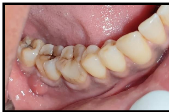
Figure 1 - Baseline picture

Following phase I therapy of in which complete supra and sub-gingival scaling and proper oral hygiene instructions were given. A week after SRP (Figure 2), excisional biopsy was performed in relation to 47(Figure 6). Before excision, the lesion was measured apicocoronally and mesiodistally as 9 x 5 mm, respectively (Figure 3). After adequate local anaesthesia, complete excision including 2 mm of healthy tissue was done using scalpel (Figure 5). Complete curettage was done, and periodontal dressing was placed (Figure 6,7).