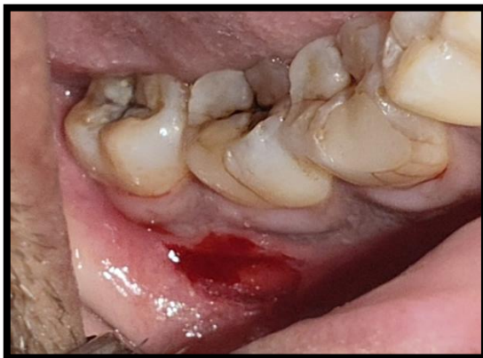
Figure 6- Complete curettage done