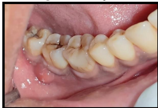
Figure 2 - 61 week after scaling and root planing