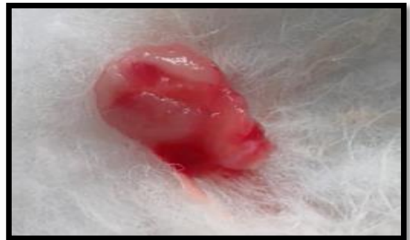
Figure 8 - Excised tissue