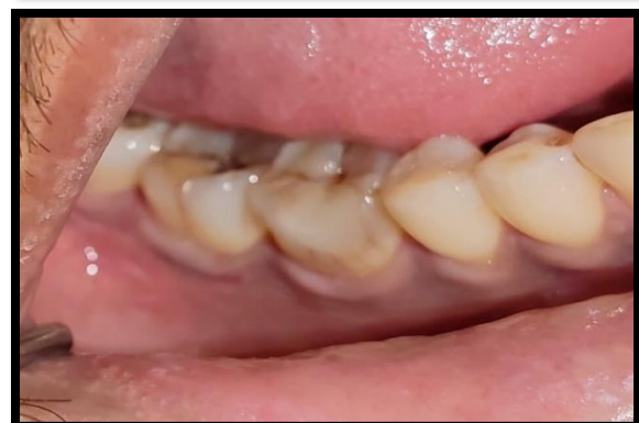
Figure 9 - Post op picture - (a)2 weeks (b)1month