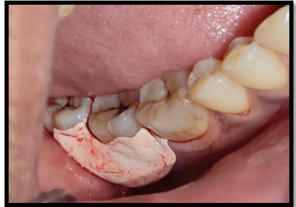
Figure 7 - Periodontal dressing placed