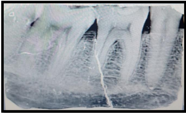
Figure 4 - Pre -op IOPA