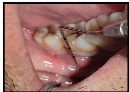
Figure 3(a,b) - Baseline measurements 9mm mesiodistally x 5mm apicocoronally